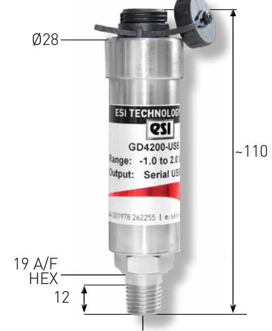
1/4" BSPM (G1/4) OR 1/4" NPTM OR F250-C