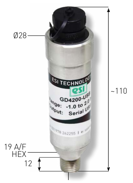
1/4" BSPM (G1/4) OR 1/4" NPTM OR F250-C